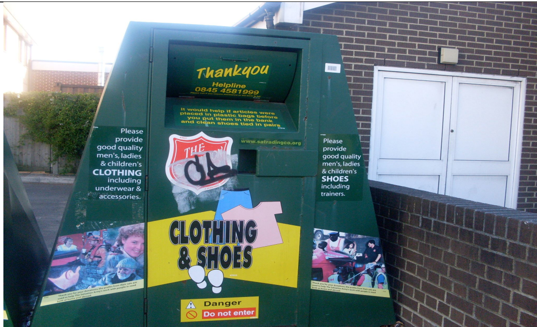
Plate 3: Photograph of a collection centre for second hand clothing items in Southampton, England