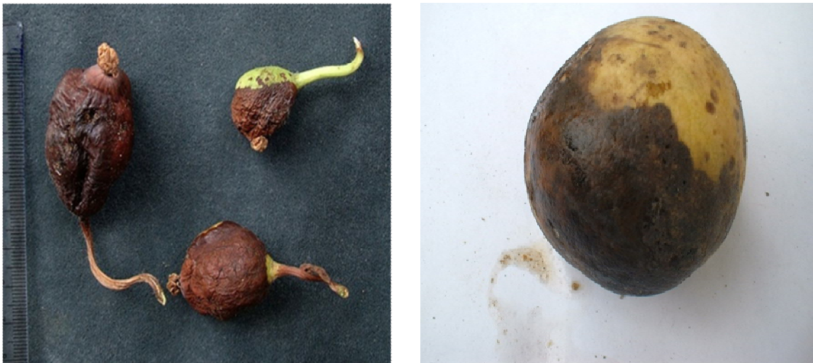
Plate 13: Fruit rot of egusi melon caused by Choanephora cucurbitarum showing: a) Rotted immature fruits b) Rotted mature fruits