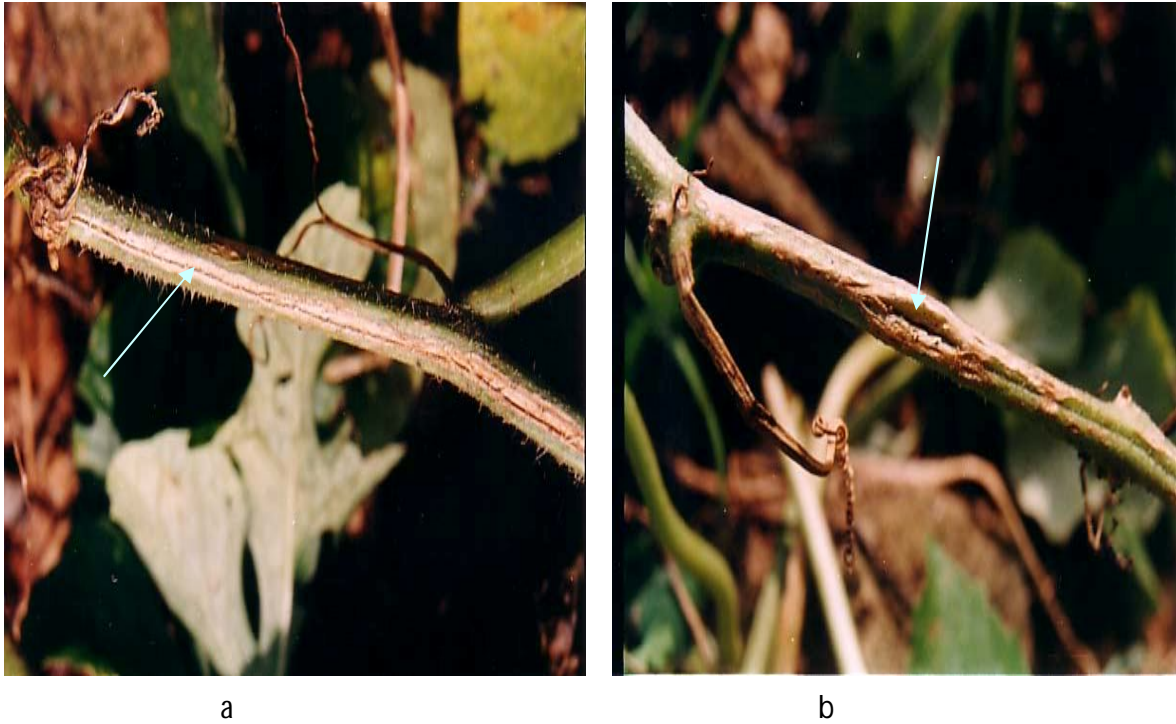
Plate 2: Stem Anthracnose showing a) slightly sunken brownish lesion on stem (arrowed) and b) lip canker on stem of melon (arrowed)