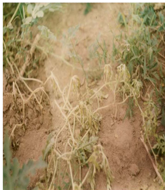
Plate 10: Wilting of runners of egusi-melon (a) early stage and (b) advanced stage on mature plants