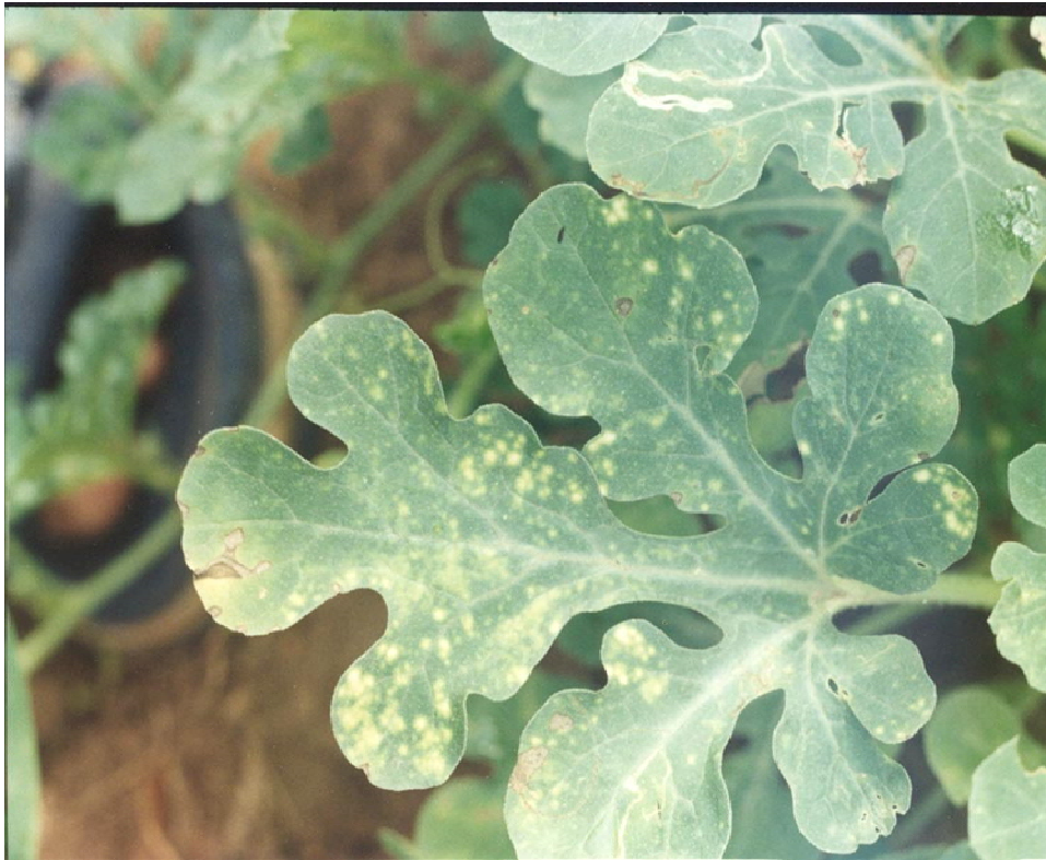
Plate 8: Leaf of egusi melon showing chlorotic lesions (arrowed) caused by downy mildew fungus