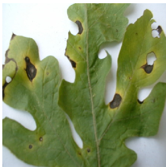
Plate 1: Anthracnose on melon leaves (arrowed); a) early stage of infection (b) late stage of infection