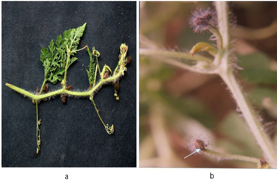
Plate 12: Flower rot of egusi melon caused by Choanephora cucurbitarum showing (a) Dead flowers on a vine (b) fungal growth on infected (dead) flowers