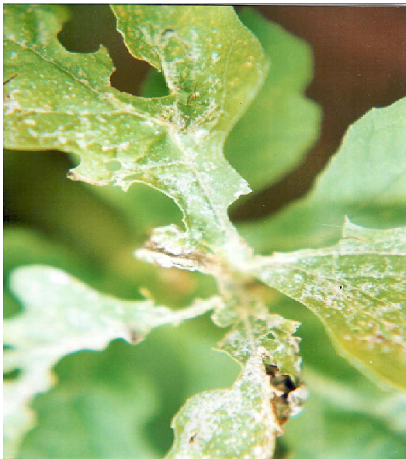
Plate 7: Egusi melon leaf showing whitish talcum-like symptom of powdery mildew (arrowed)

At the early stage of infection, symptoms appeared on the upper surface of the oldest leaves near the crown. Symptoms appeared as 2-4, small and pale-green to yellow angular spots (Plate 8). The underside of the leaves opposite the yellow spots became covered with layers of greyish mycelial growth. The leaf veins confined the spots and at advanced stage, severely infected leaves became chlorotic, turned light brown and shrivelled.