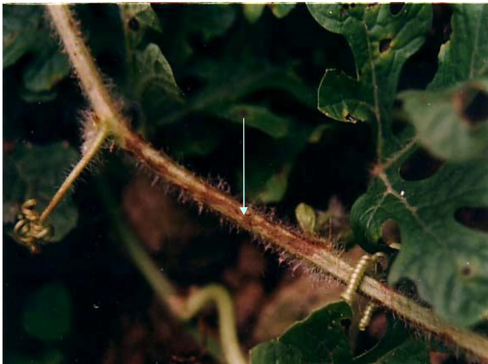
Plate 5: Brown stem blight (arrowed) caused by Didymella bryoniae