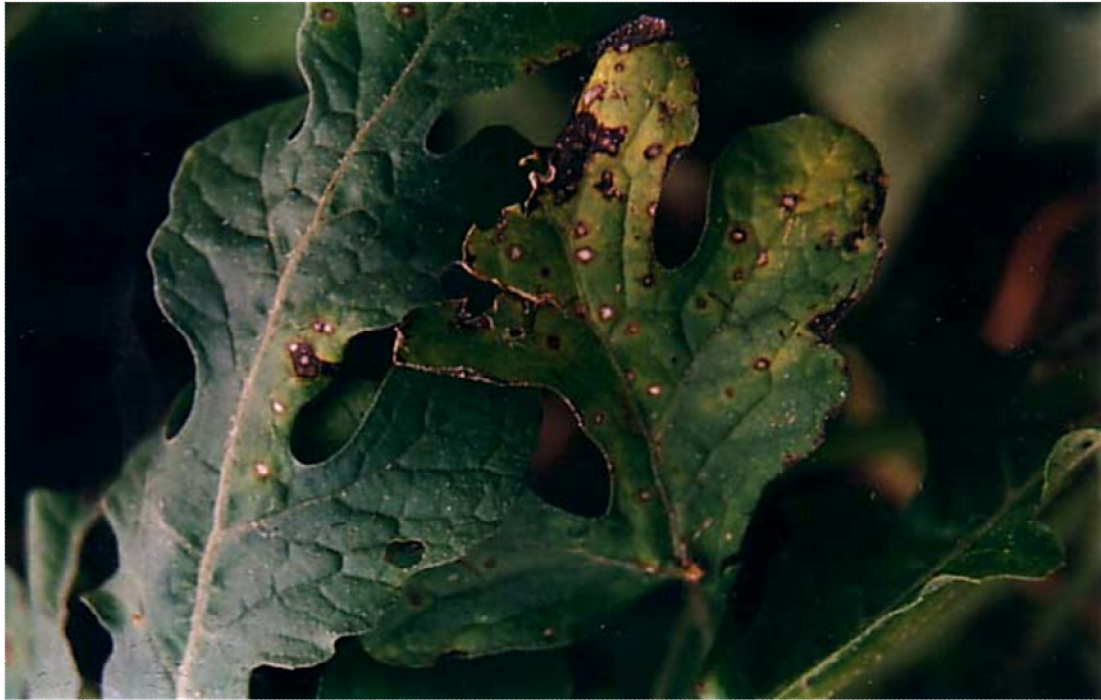
Plate 11: Symptom of Cercospora leaf spot (arrowed)

and necrotic. Spots were small, circular to irregularly circular, with white to tan centres and dark margins (Plate 11).