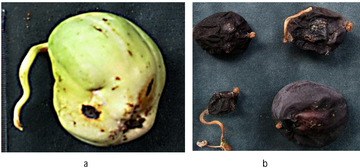
Plate 3: Anthracnose disease on egusi melon fruits