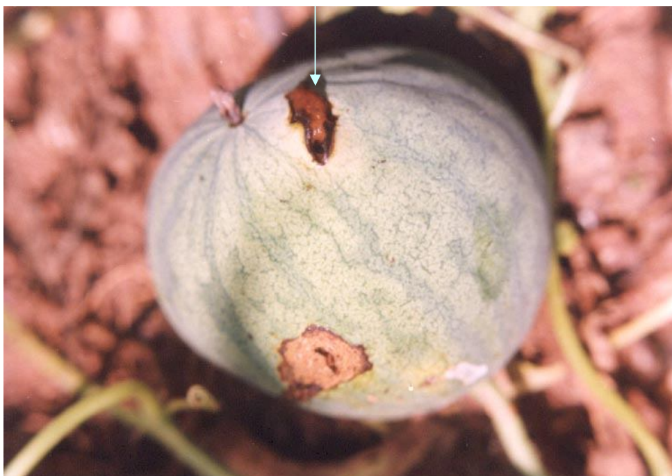
Plate 6: Dark brown fruit rot with brownish gummy exudate (arrowed) caused by Didymella bryoniae