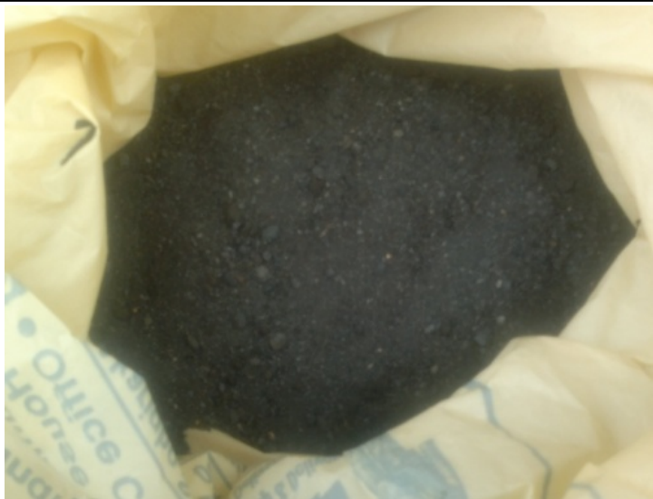
Figure 1: Foundry Sand Sample

The construction industries rely heavily on conventional materials such as cement, granite and sand for the production of concrete. The high and increasing cost of these materials has greatly hindered the development of shelter and other infrastructural facilities in developing countries. There arises the need for engineering considerations for the use of cheaper and locally available materials to meet desired need to enhance self efficiency and lead to an overall reduction in construction cost for sustainable development (Olutoge, 2010).